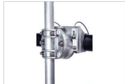
CAN-BRAC Universal Signal