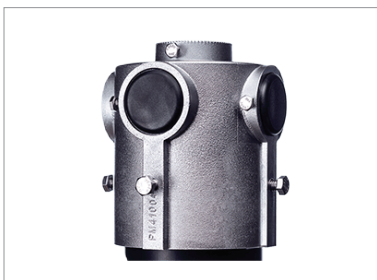
Post Top Bracket