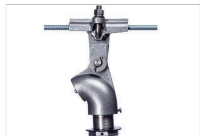
Span Wire Hanger