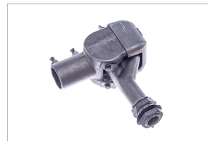
Rubber Cushioned Mast Arm Hanger