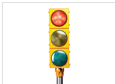
Polycarbonate Traffic Signal